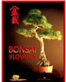
BONSAI SLOVAKIA Book of Friendship Slovak-English