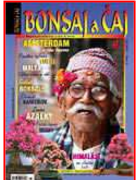
BONSAI & TEA MAGAZINE